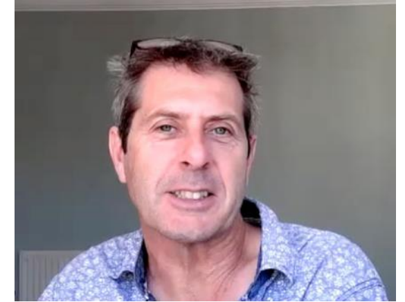
Geopark In Focus Host Geopark Patron, Professor Iain Stewart MBE