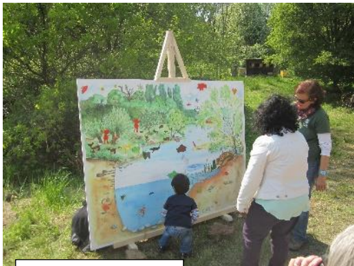
Geopark name. Country