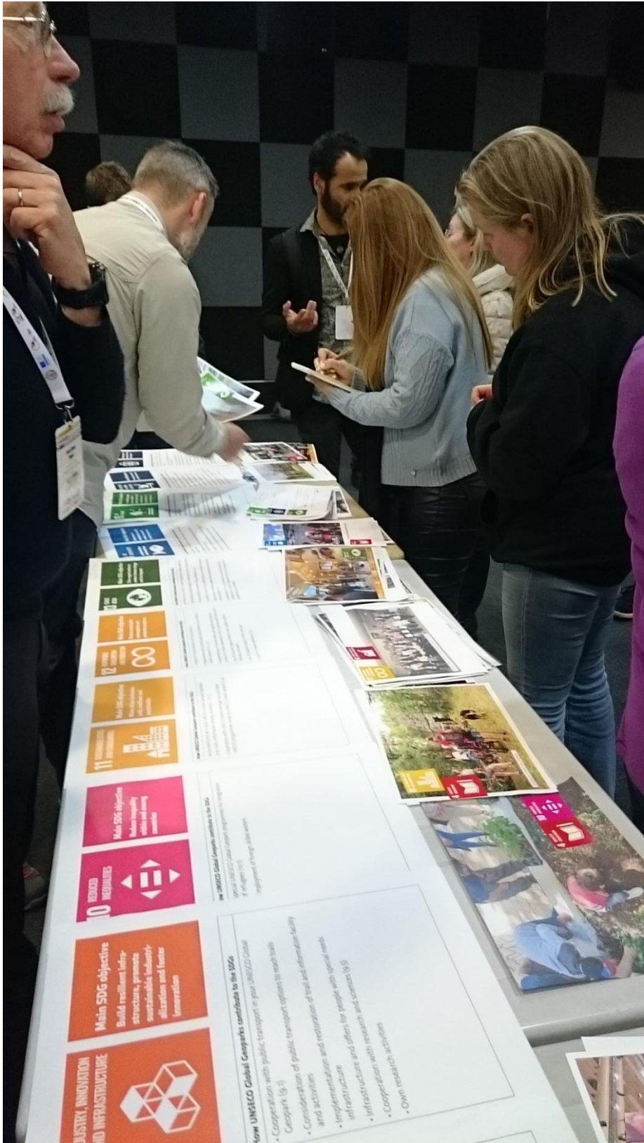
Quantification of first results – images and chosen SDGs