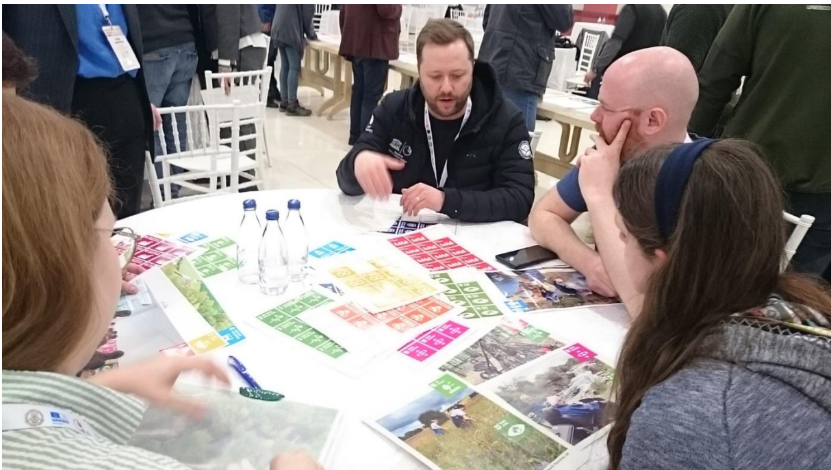
Coming together and exchange with colleagues towards the proper SDG for their activities