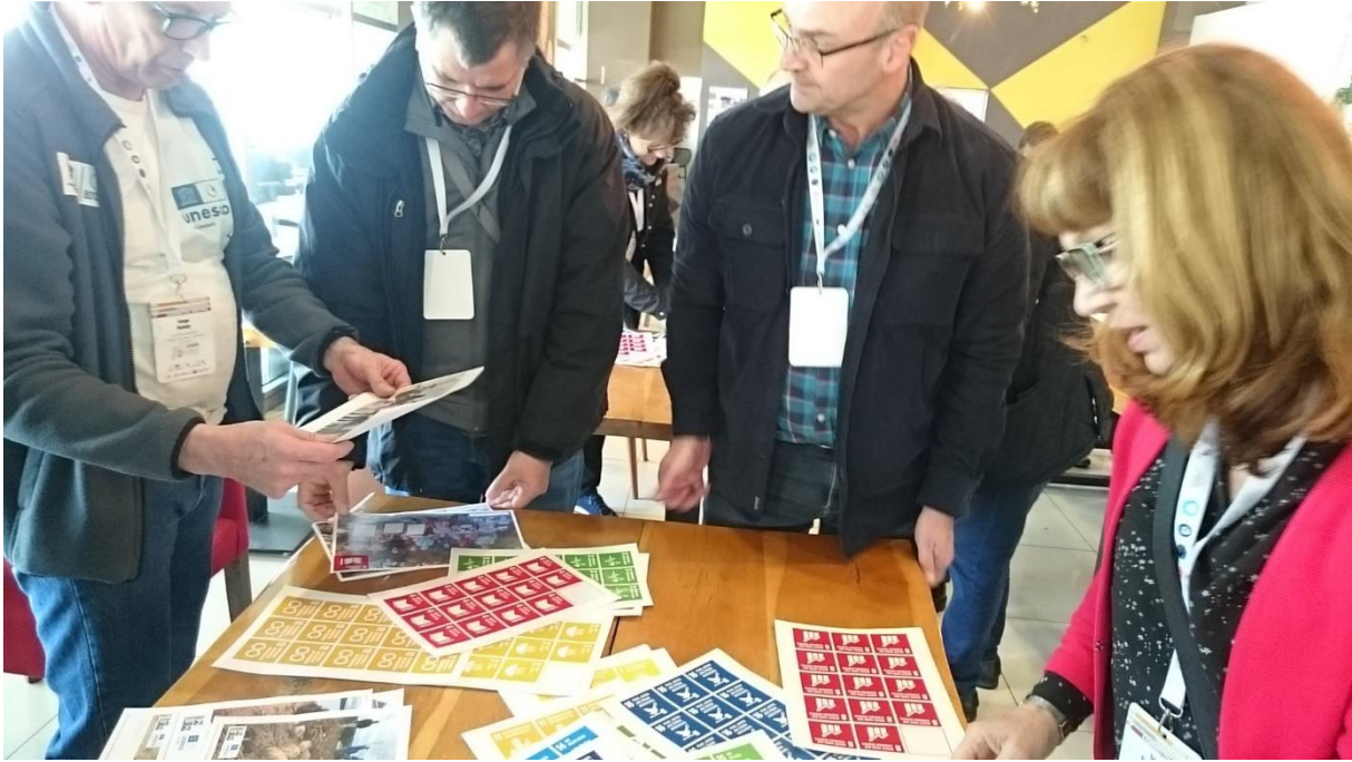
Intense discussions how to select the right SDG / sticker