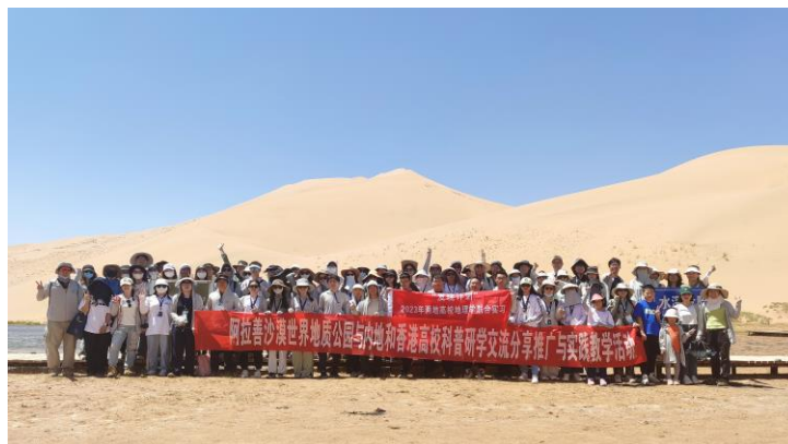
Educational excursions with Hongkong University , Lanzhou University etc. ,and local high school students.