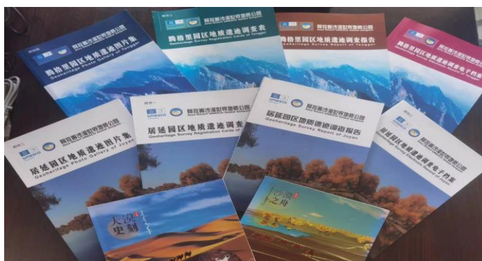
Achievements of scientific research and popularization projects in 2023 (Photos of the most important events of the year)