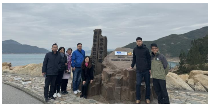
Experience exchange and communication with 9 Geoparks including Hongkong, Danxia, Leiqiong etc.