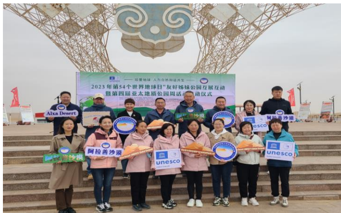
Promotion cooperation with 29 Geoparks on Earth Day