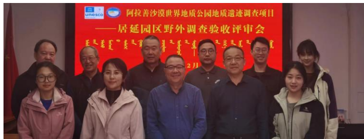
Geopark finish Geoheritage survey project in Tenggeli Area and Juyan Area