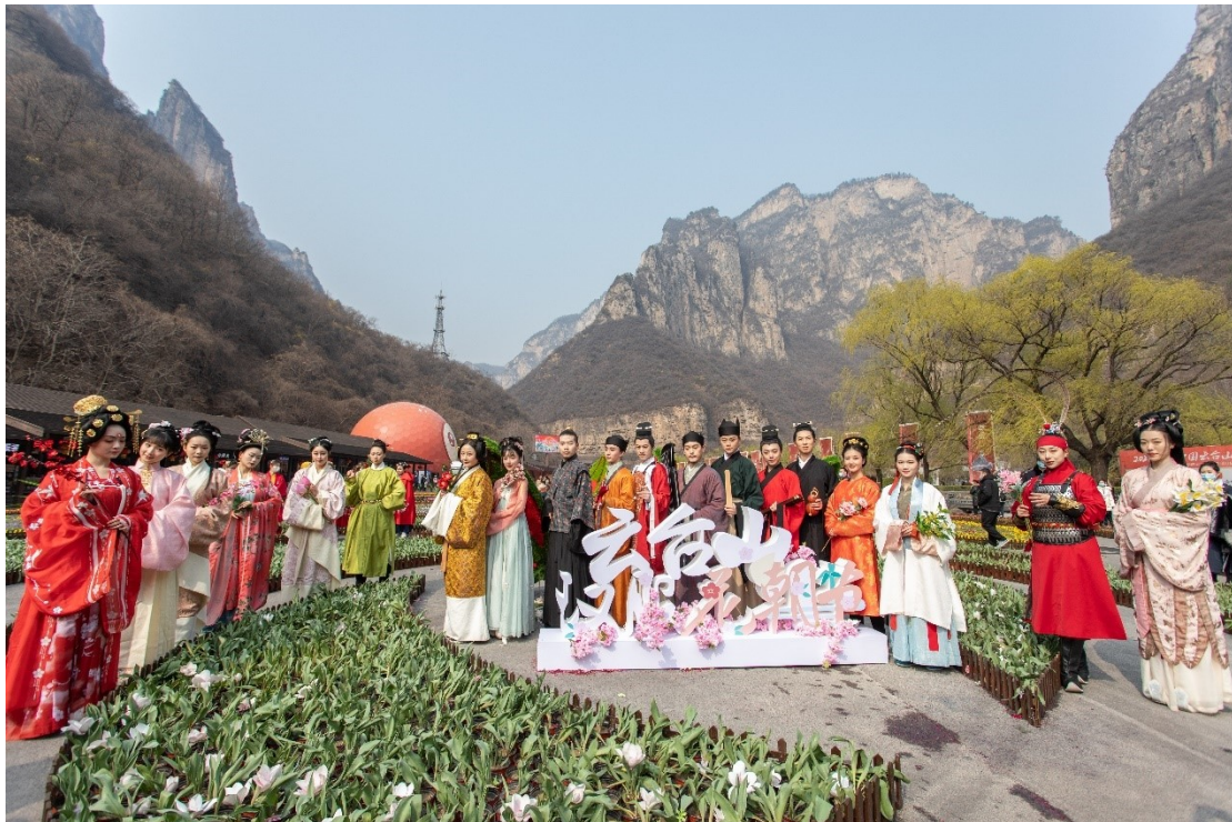
The 3 rd Flowers Festival with Hanfu was unveiled in Yuntaishan UGGp on March 6 th , 2021

Representative photo with caption (from the most important event this year):