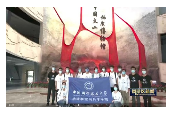
Outdoor science class of University of Science and Technology of China in July