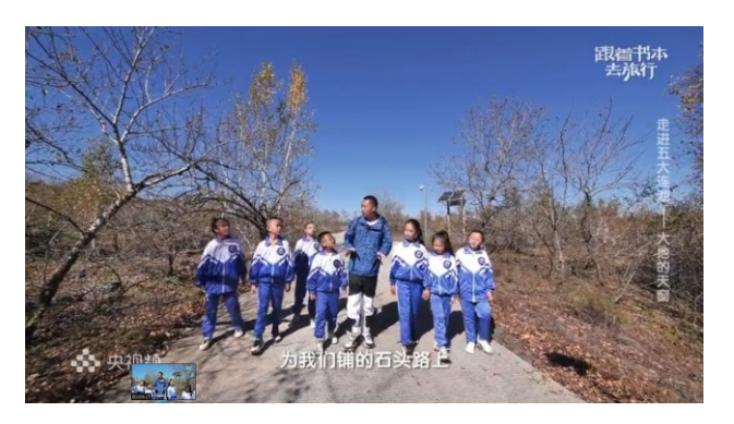
Students science programme Travel with books on CCTV