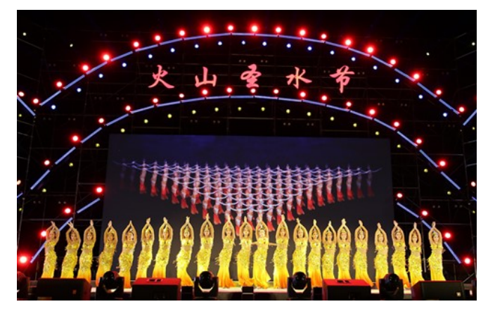
Held the 37<sup>th</sup> Holy Spring Festival in June