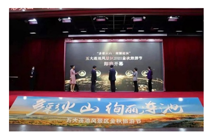
The Autumn Festival was Open in Wudalianchi in Sep.