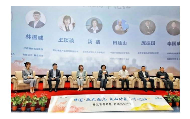
Held mineral spring forum in June