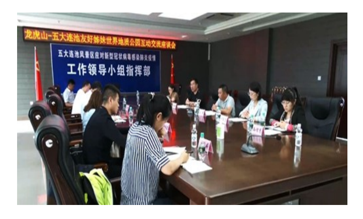
Longhushan UNESCO Global Geopark Visited Wudalianchi in June