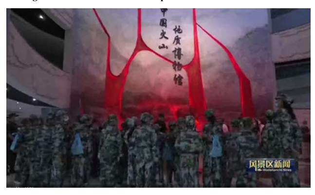
Science Summer Camp in July