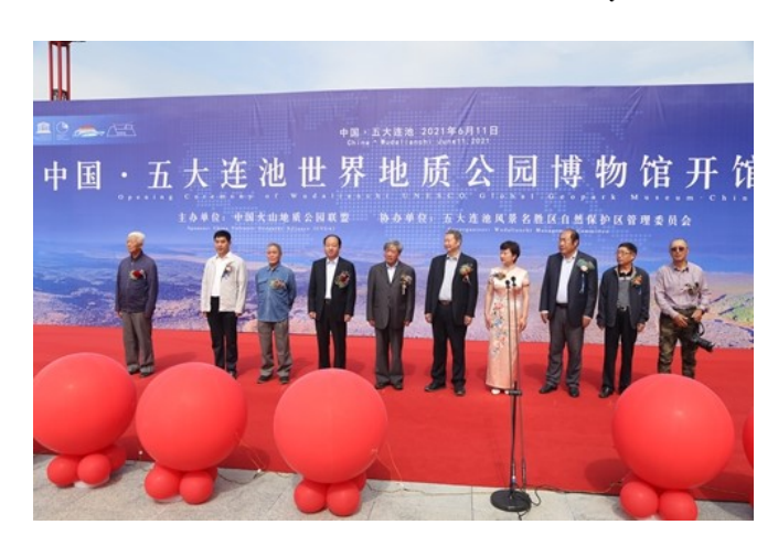
Wudalianchi UNESCO Global Geopark Museum was open to public in June