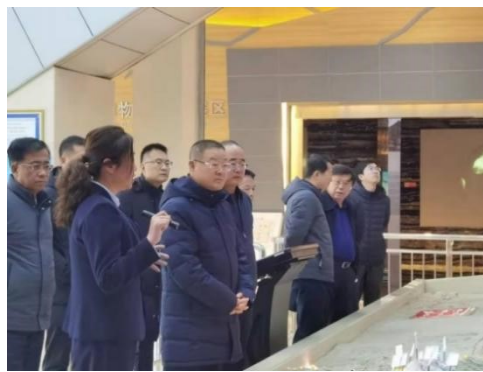
Photo 2 Inspection and instruction of the delegation led by Liu Tao, Vice Governor of Qinghai Province and Zhao Dong, Mayor of Golmud City in the Museum