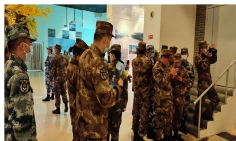
Photo 4 Graduate students from the National University of Defense Technology visit the Museum accompanied by the Minister of the People's Armed Forces Department of Golmud City