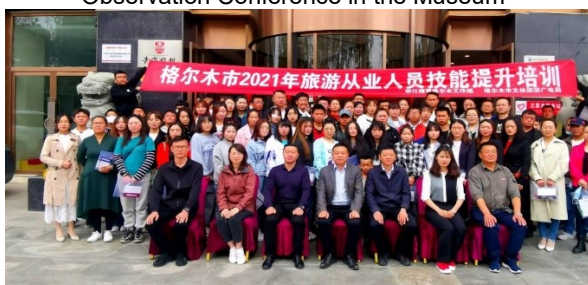
Photo 3 Skill and etiquette improvement training for tourism personnel in Golmud City