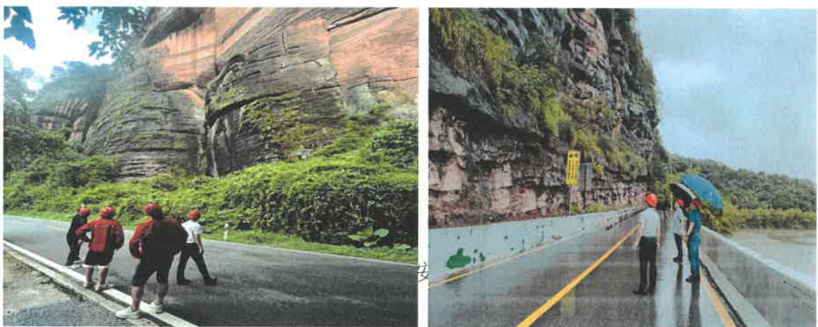
Safety patrols for geological hazard points.

- Safety hazard inspections were carried out, and real-time monitoring of geological hazard points for “Eyupashan” (Crocodile Climbing the Mountain) was conducted. The dangerous rock mass at the entrance of Niubi Qiaotou was cleared, and roads damaged by summer storms were repaired.