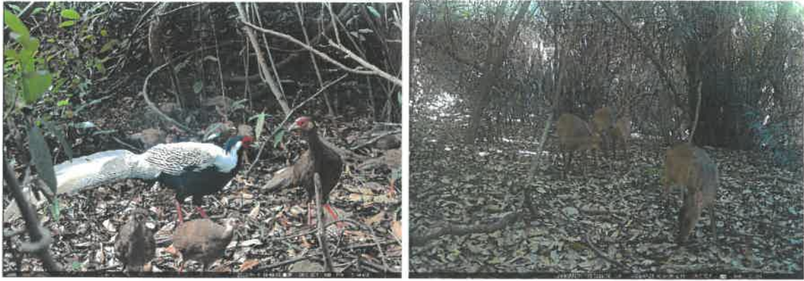
The infrared cameras captured footage of white pheasants and sika deer.

- Safety hazard inspections were carried out, and real-time monitoring of geological hazard points for “Eyupashan” (Crocodile Climbing the Mountain) was conducted. The dangerous rock mass at the entrance of Niubi Qiaotou was cleared, and roads damaged by summer storms were repaired.