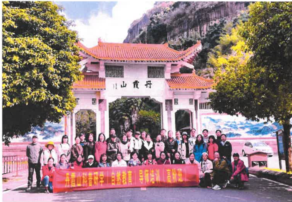
2021 Danxiashan Training (Advanced) for Tutors of Field Study (Nature Education)

Number of press release: 10 pieces of news had been released and adopted by CGN, 2 pieces of news had been released and adopted by GGN. 177 pieces of news had been released and adopted by news media, 798 pieces of information had been released on official website and WeChat official account platform.