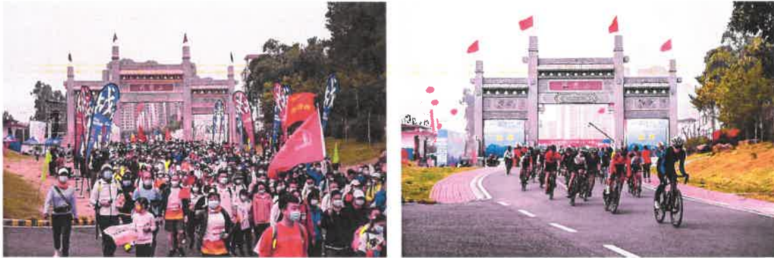
Three major sports events in Danxiashan UGGp