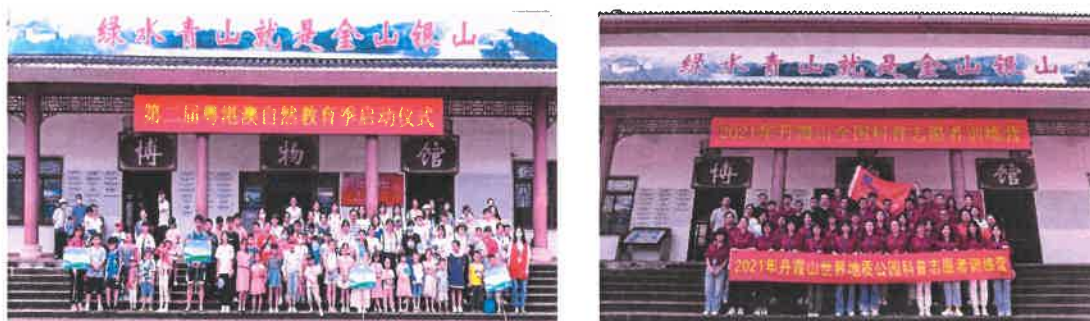
Various public education activities in Danxiashan UGGp

The Opening Ceremony of the 2 nd Nature Education Season of Guangdong, Hong Kong and Macao, Danxiashan Science Popularization Volunteers Training Camp, Danxiashan Nature Observation Contest, the 3 rd “Danxiashan Cup” National Photography Exhibition, the 2021 Danxiashan Wild Plant Identification Competition, etc. had been held in Danxiashan, attracting more than then thousand people especially teenagers to attend.