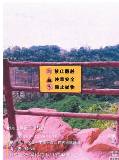
New forest fire prevention and safety warning signs