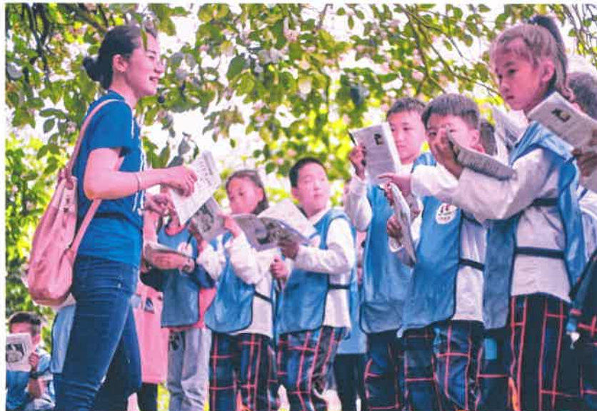
A series of Danxiashan science popularization activities held in communities