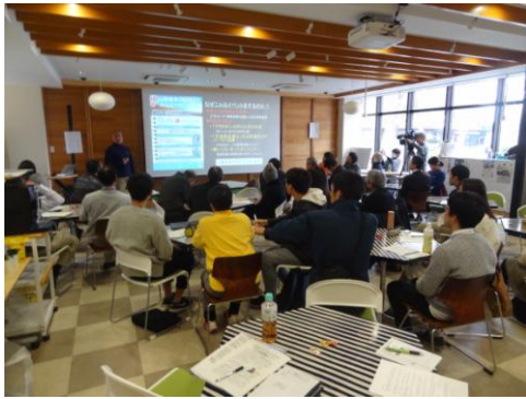
Academic Research Forum

(Minna de Osyaberi = Talking with Everyone)