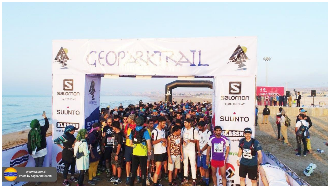
Geopark Trail Running

Representative Photo (from the most important event this year)