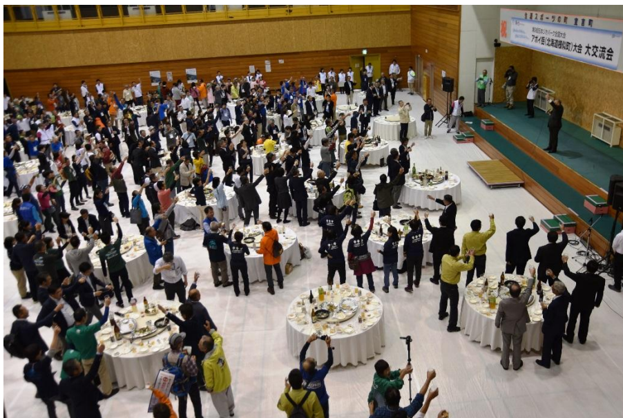
The welcome and greeting party at Japanese Geoparks Network National Conference