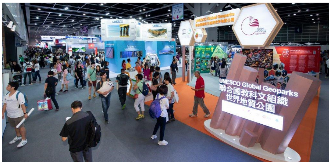
International Travel Expo 2018 Hong Kong co-organised with Global Geoparks Network