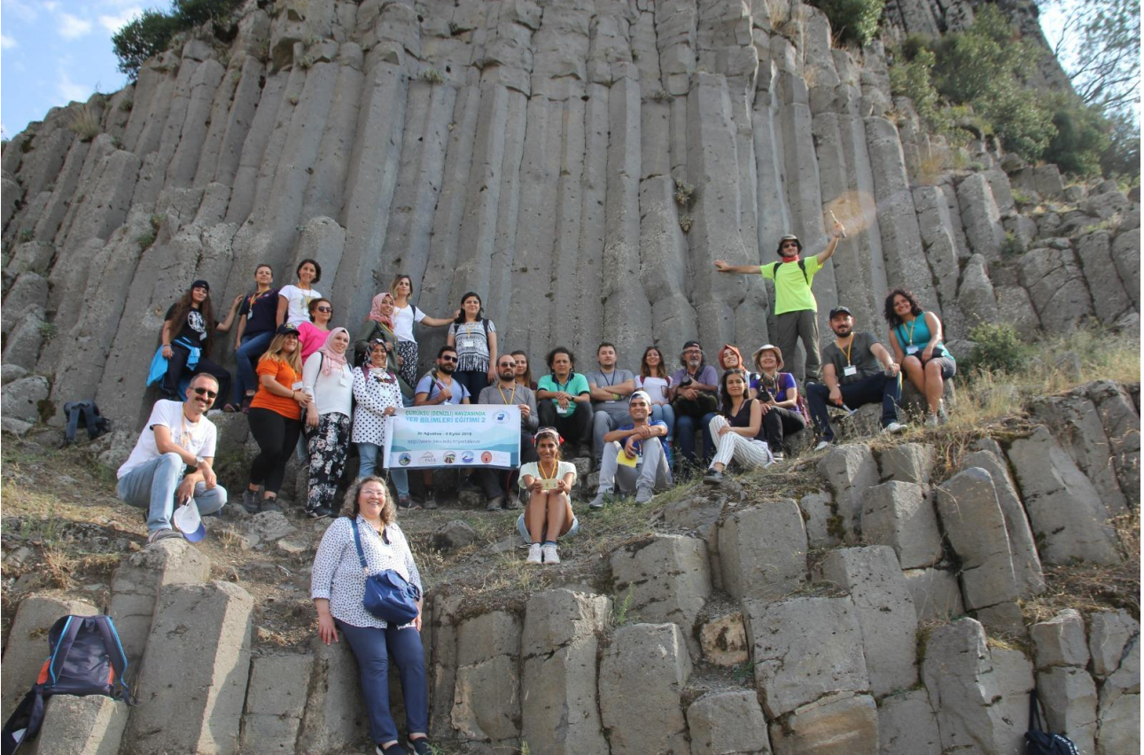
Fig 1:A group of teacher of earth science from all over the Turkey, visiting the Kula UNESCO Global Geopark within the scope of TUBITAK Nature Education Projects.

Year of inscription / Year of the last revalidation: 2013 / 2017