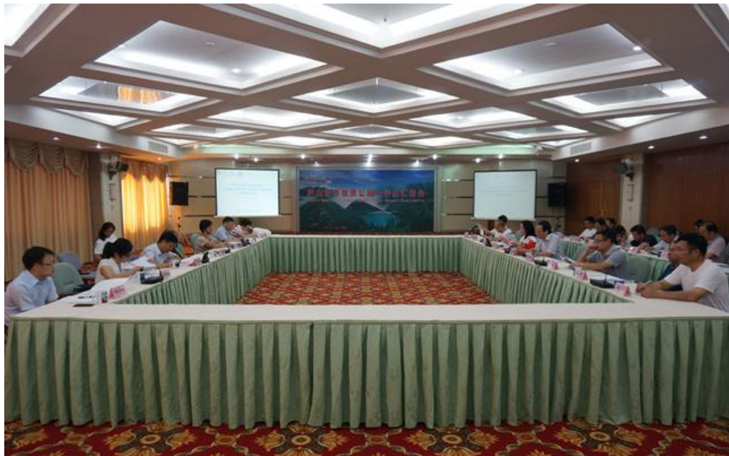
Lushan UNESCO Global Geopark Revalidation

Year of inscription / Year of the last revalidation: 2004/2018