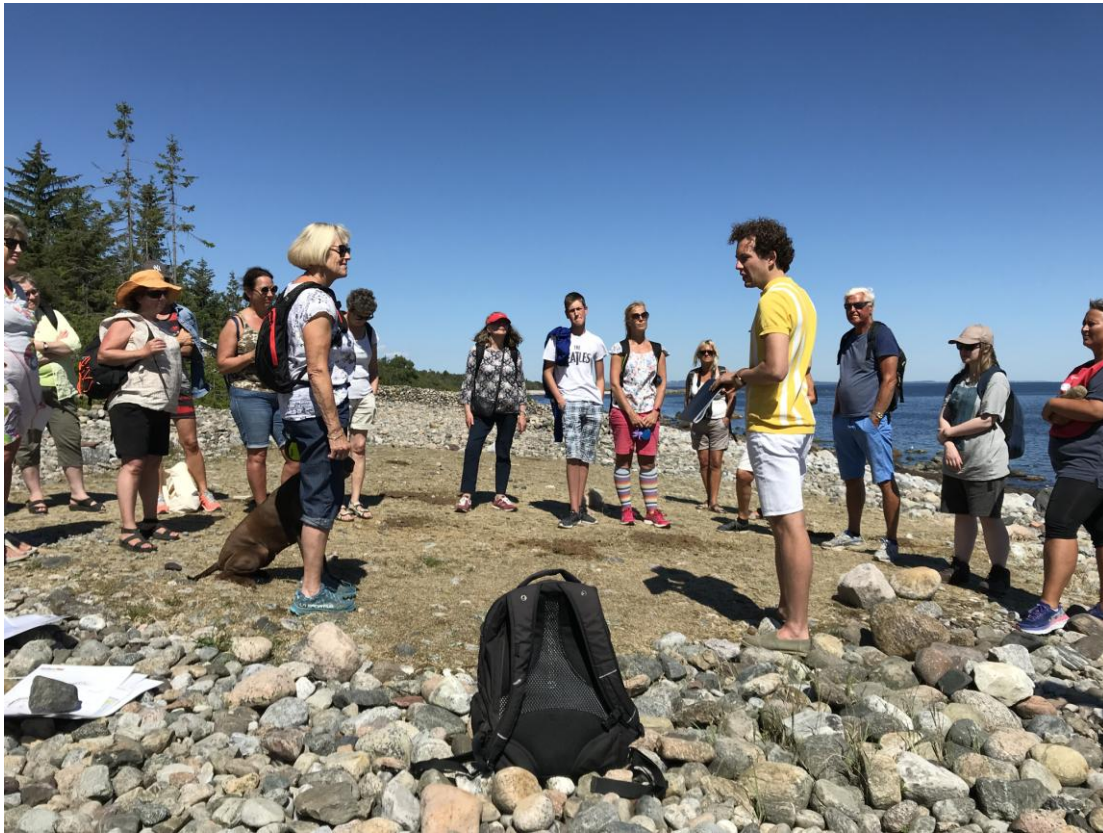
Photo: "The painter Theodor Kittelsen and the secret of the moraine island"

Gea Norvegica UNESCO Global Geopark, Norway, EGN 2006 / 2017