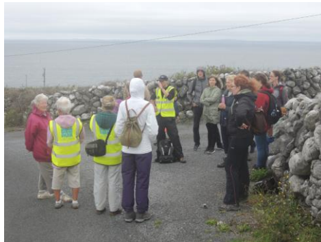
National Heritage Week guided walk August 2018

Representative Photo (from the most important event this year)