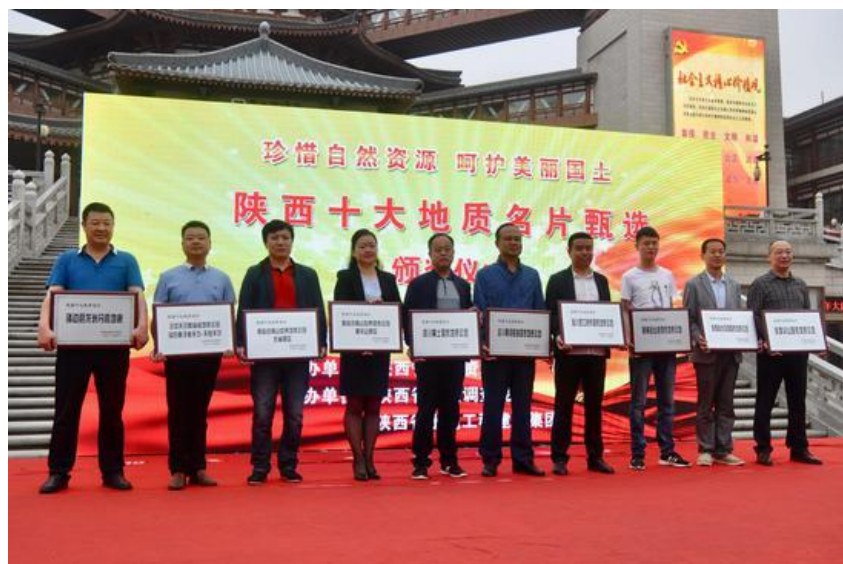
The Geopark is praised the 10 Geology Card of Shaanxi Province