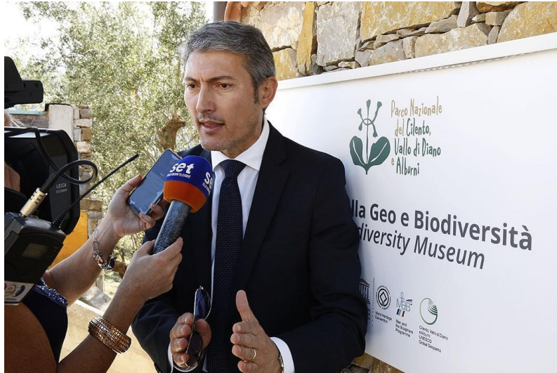
Inauguration of the Geo biodiversity Museum

Representative photo with caption (from the most important event this year)