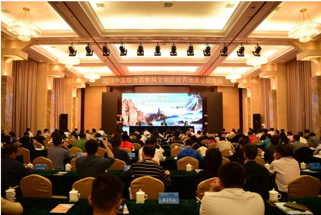
2018 Annual Conference of China UNESCO Global Geoparks

Representative Photo (from the most important event this year)