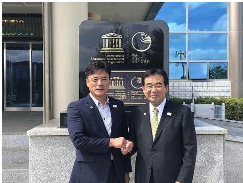
Partnership agreement signing ceremony with Cheongsong UGGp, Korea (2018/07/14)