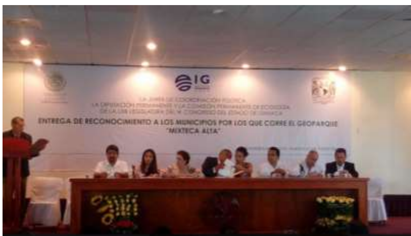
Recognition to the municipalities of the Mixteca Alta UGG by the Oaxaca State Congress