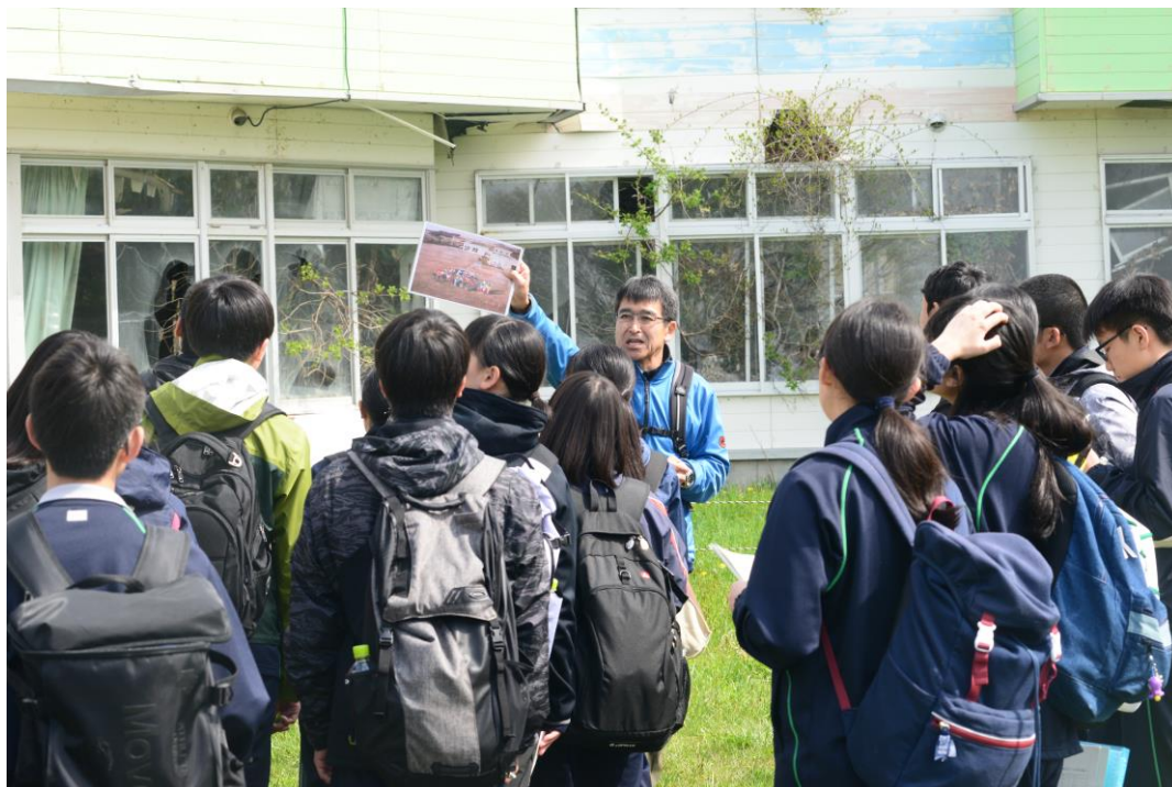
Geopark educational programmes to local school students

Year of inscription / Year of the last revalidation: 2009 / 2019